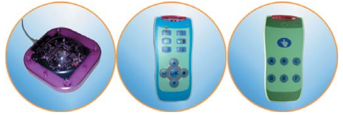
EXAMPLE SYSTEM SETUP

IQ Feedback Education Version supports up to 100 terminals and Conference Version supports 400 simultaneously without jamming and error codes.